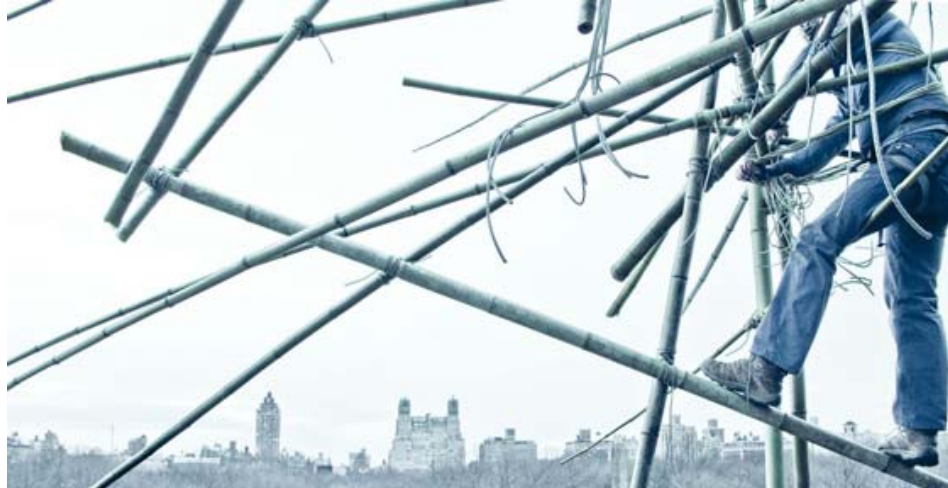
Doug + Mike Starn on the Roof: Big Bambú

Invited by The Metropolitan Museum of Art to create a site-specific installation for The Iris and B. Gerald Cantor Roof Garden, the twin brothers Mike and Doug Starn (born in New Jersey in 1961) present their new work, Big Bambú: You Can't, You Don't, and You Won't Stop . The monumental bamboo structure, ultimately measuring 100 feet long, 50 feet wide, and 50 feet high, takes the form of a cresting wave that bridges realms of sculpture, architecture, and performance. Visitors witness the continuing creation and evolving incarnations of Big Bambú as it is constructed throughout the spring, summer, and fall by the artists and a team of rock climbers. Set against Central Park and its urban backdrop, Big Bambú suggests the complexity and energy of an ever-changing living organism. It is the thirteenth-consecutive single-artist installation on the Roof Garden.